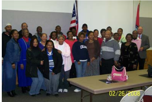
Bootheel Graduating Class

We recently completed our first class in the Bootheel area 36 applicants complete the training in Portageville. Of those 21 submitted application for the capitalization grant.