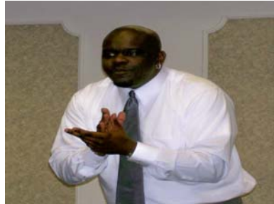
Speaker-PIN Youth Recognition Banquet