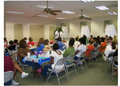
PIN Youth Recognition Banquet 2008