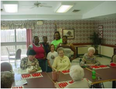
Adopt a Grand-Friend in New Madrid Co.