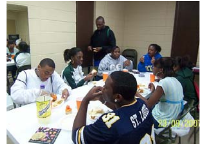
Dunklin County Youth Meeting