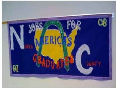
JAG Career Association Banner