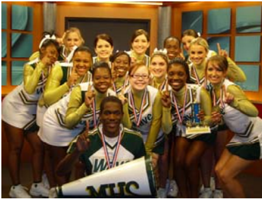
Several Malden WIA participants cheer